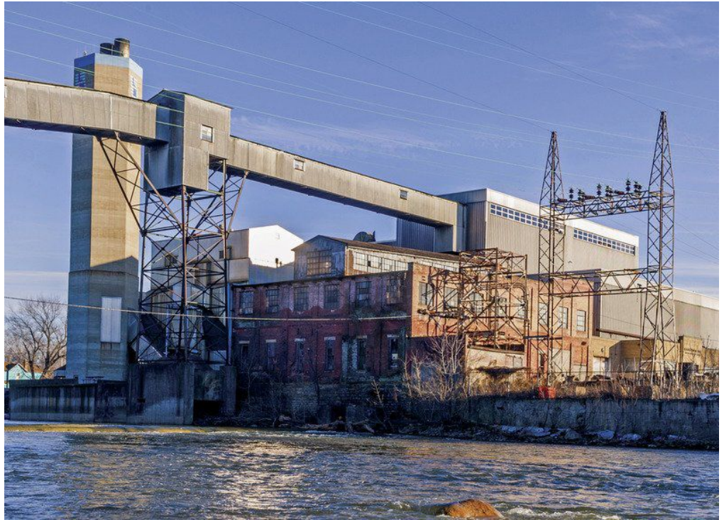
Logansport Power Generating Plant in Logansport, Indiana

Logansport Municipal Utilities retired the Logansport Power Generating Plant in Logansport, Indiana in 2016, but residents are now in full support of demolishing the plant completely. Asbestos-containing material is falling to the ground in areas around the plant, and potentially entering the Wabash River, creating human and environmental health hazards. Link