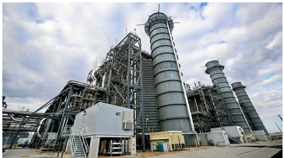
The 495-foot stack at the Florida Power & Light Plant in Indiantown, Florida

Duke Energy's Gallagher Station, a coal-fired power plant in New Albany, Indiana, was retired earlier this month. Duke Energy was fined in 2009 for Clean Air Act violations at the Site and was engaged in a federal lawsuit, ultimately paying a $1.75 million civil penalty and additional amounts on environmental mitigation projects. Link