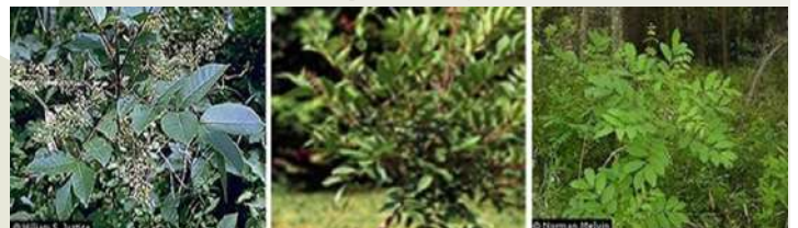
Poison Sumac; Photos courtesy of U.S. Department of Agriculture