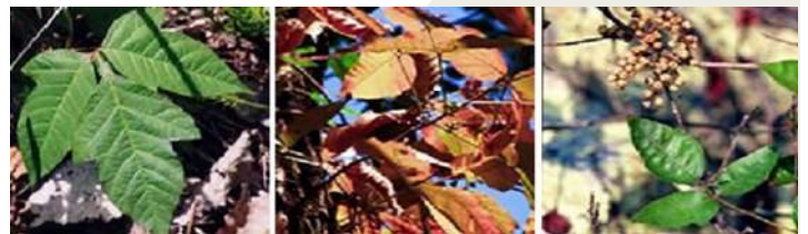
Poison Ivy

Wildlife is part of what makes many of our sites beautiful places to work, but we need to take precautions while working in rural and wilderness areas because of these hazards.