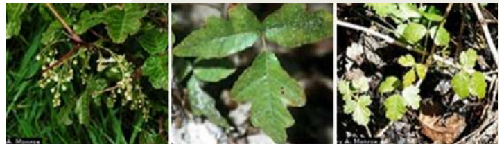
Poison Oak