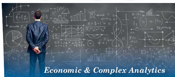
Economic & Complex Analytics