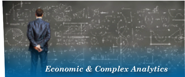
Economic & Complex Analytics