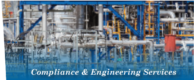
Compliance & Engineering Services