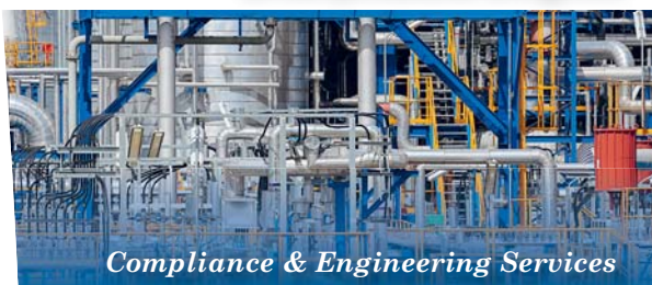
Compliance & Engineering Services