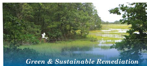
Green & Sustainable Remediation