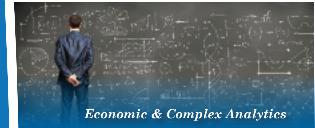
Economic & Complex Analytics