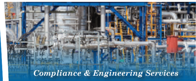
Compliance & Engineering Services