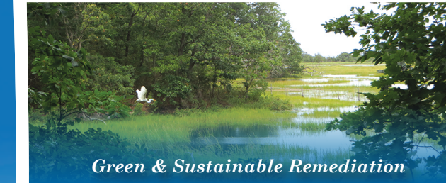
Green & Sustainable Remediation