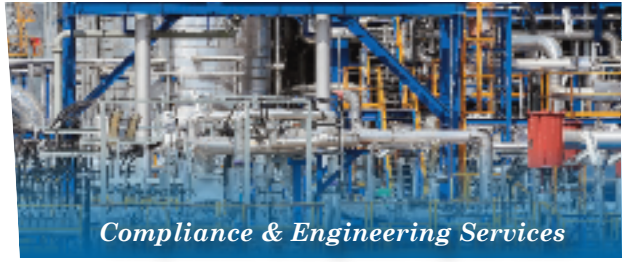
Compliance & Engineering Services