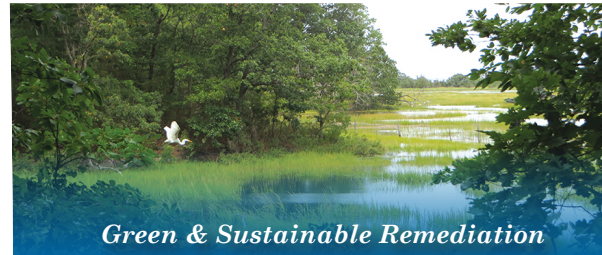
Green & Sustainable Remediation