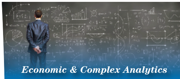
Economic & Complex Analytics