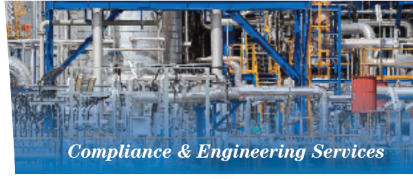
Compliance & Engineering Services