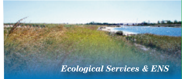
Ecological Services & ENS