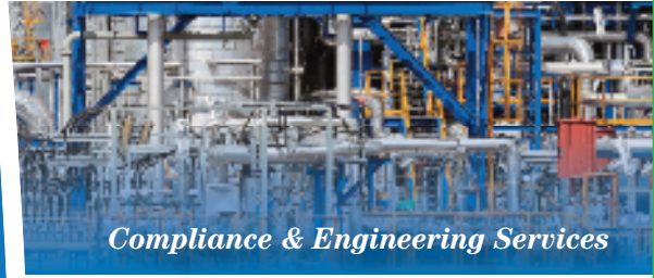
Compliance & Engineering Services