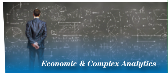
Economic & Complex Analytics