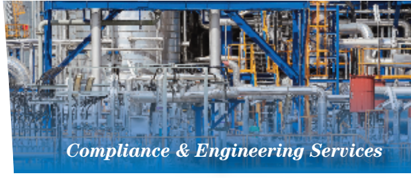
Compliance & Engineering Services