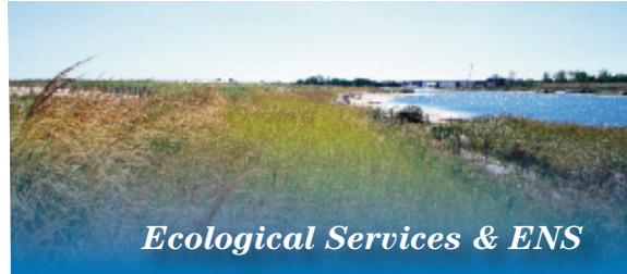
Ecological Services & ENS