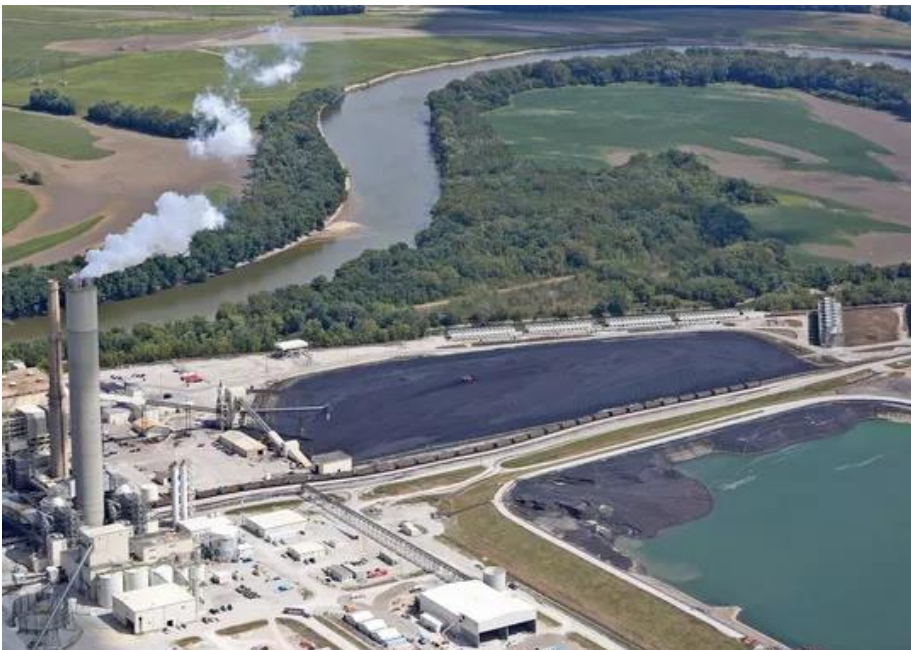
Coal Ash Pond Near River

http://www.wfae.org/post/duke-meets-deadline-water-supplies-coal-ash-neighbors#stream/0