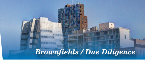
Brownfields / Due Diligence