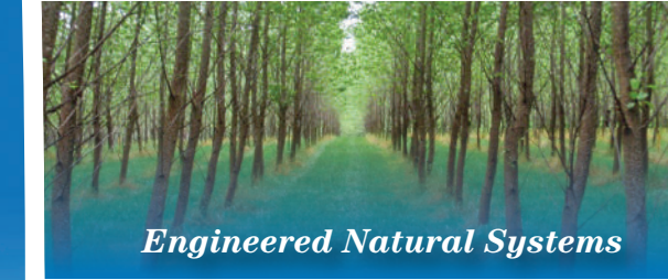
Engineered Natural Systems